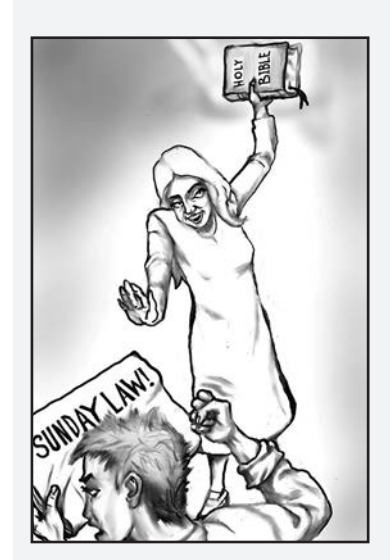
God's people will accept the Bible, and only the Bible, as the rule for all teachings and new ideas.