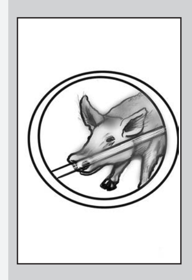
God doesn't want His people to eat pork or any other meat that isn't clean (Leviticus 11:7). God also doesn't want His people to drink alcohol (Proverbs 20:1).