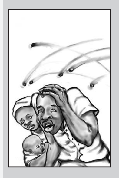
The families stopped going to church when their neighbors threw stones at them.