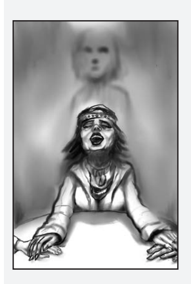
The belief that we can talk with the dead is part of Satan's big plan to make people his slaves.

The belief that the dead go to heaven right away when they die has been around for a long time. People use a few Bible texts in the wrong way to support this idea. But this belief leaves people with no protection against Satan, now or in the end times.