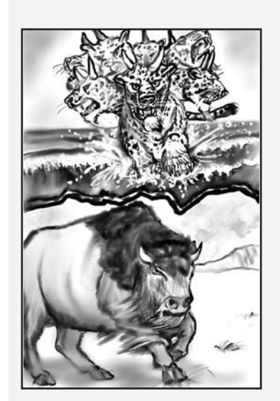
Revelation 13 introduces the dragon's two helpers: the sea beast and the land beast.

THE MARK OF THE BEAST (Revelation 12:12, 17)