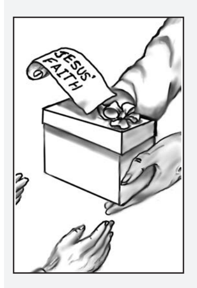
The faith of Jesus is a precious gift. Jesus gives us this gift when we believe in Him.

God's loyal followers will have faith in Jesus. They also will have the faith of Jesus. The faith of Jesus is a faith so deep and powerful that all the demons in hell and all the trouble and suffering on earth can't destroy it. When we have the faith of Jesus, we will trust God when we cannot see any reason to trust Him. We will believe when we can't understand why. We will hope when life looks hopeless. The faith of Jesus is a precious gift. Jesus gives us this gift when we believe in Him. This gift will give us strength during the hard times ahead. Soon we won't be allowed to buy or sell. We will be attacked, thrown in jail, or killed for our faith. The faith of Jesus will protect us in earth's final hours until Jesus comes back.