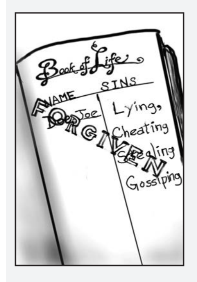
We can meet with God only if Jesus pardons us and removes our sins with His blood.