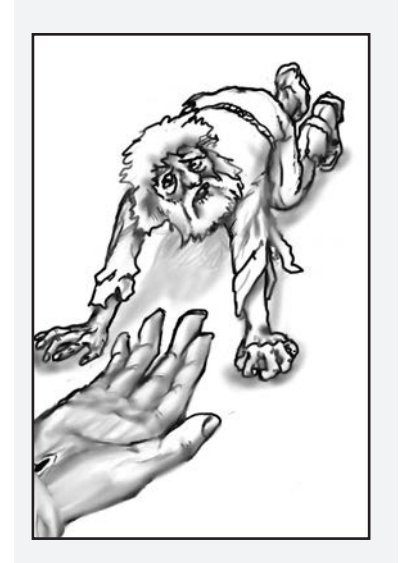
God's plan to save sinners solves both the worldwide war between good and evil and saves us from sin and Satan.

God's plan to save sinners is a complete plan. God's plan solves both the worldwide war between good and evil and saves us from sin and Satan. When we come to Jesus with faith, He makes us clean and holy.