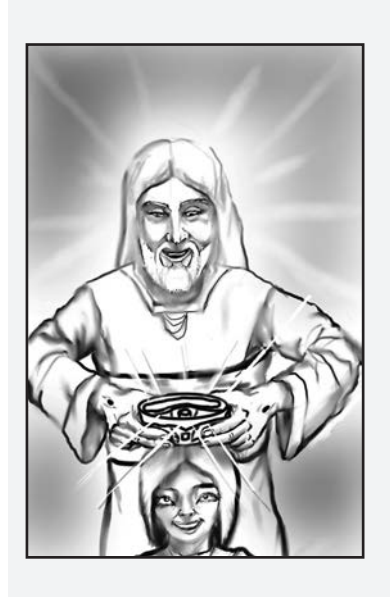
Jesus' work as judge will show who will get a reward or punishment at His coming.

We do not need to fear God's work as Judge. Jesus loves and forgives us. He removes our guilt. He makes us holy. Jesus helps us win the fight against sin.