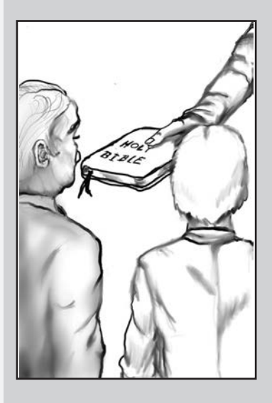
The stranger told them, "Take this Bible and come to our meeting this evening at my church."