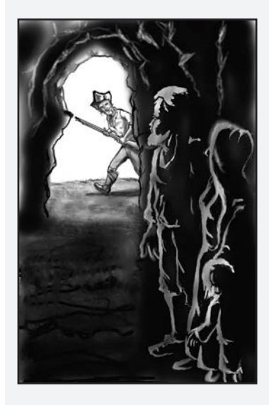
"God's enemies hunted the ones who were brave enough to announce Bible truth."

ADDITIONAL THOUGHT: "The church and the government outlawed the Bible. Church leaders changed its teachings. Men and demons worked together to keep people from learning Bible truth. God's enemies hunted the ones who were brave enough to announce Bible truth. These brave souls were hurt, put into prison, or killed for their faith. Some of these Protestants were forced to run to the mountains for safety. They hid in caves and in holes in the earth. At this time, God's two witnesses preached in clothes that people wear to show they are sad. [This word picture shows us that God's loval followers continued to share Bible truth during hard times.] God's two witnesses continued to preach for 1,260 years. In the worst times, God had servants who loved Him and the Bible. God gave these loyal servants wisdom and strength to announce His truth during this time."-Ellen G. White, The Great Controversy, pages 267, 268, adapted.