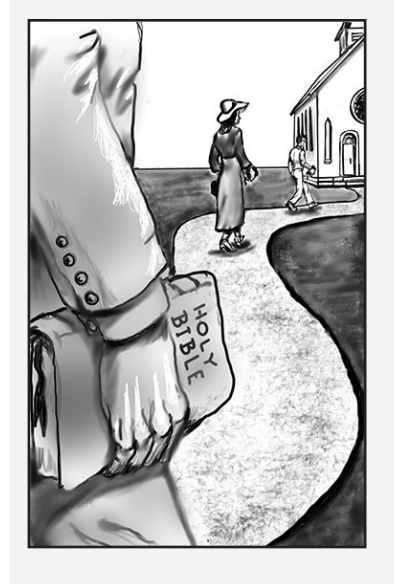
A people group that knows about Jesus has enough churches, Bibles, and other religious books in their own language.

Task #2: Some of your "followers" may be ready to accept Jesus. Maybe they're ready to come to church for the first time. What experience will they have in your church? How ready is your church to welcome new people? Make a plan for welcoming visitors and share it with your church leaders. Work with your leaders to put the plan into action.