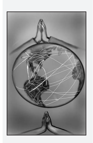
"Christians must join together as one to give God's final warning to everyone on earth."

How has this quarter's Bible study guide helped you better understand more about God's work? How important is His work to save people? How has our study helped you better understand the part you and your church have in this plan?