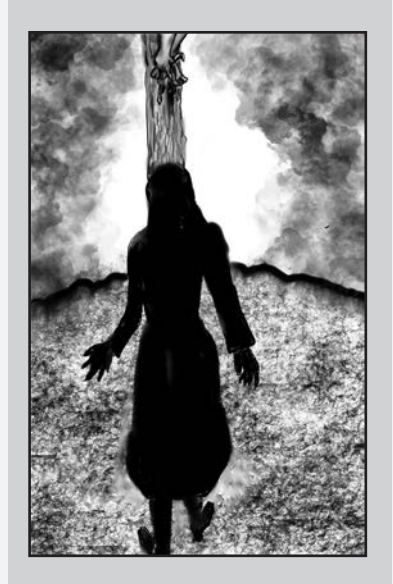
"Jesus paid the price for my sins on the cross."