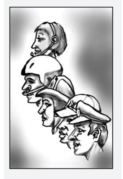
The Bible tells us that Jesus died for all people. If you are a human, Jesus died for you.

Jesus died for you. Is there anything you've done that He can't forgive? Explain why His death is enough to pay for your sins.