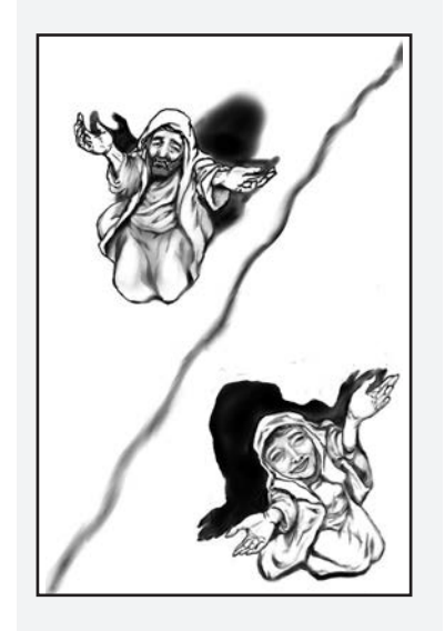
"In Bible times, the Lord worked in a wonderful way in the lives of holy women. These women worked with men that God chose to do His work."

ADDITIONAL THOUGHT: "When trouble comes, every family, school, parent, teacher, and child who knows the Good News about Jesus will need to answer the question that Mordecai asked Esther: 'Who knows? It's possible that you became queen for a time just like [the same as] this [time].' Esther 4:13, 14, [NIrV]."—Ellen G. White, Education , page 263, adapted.