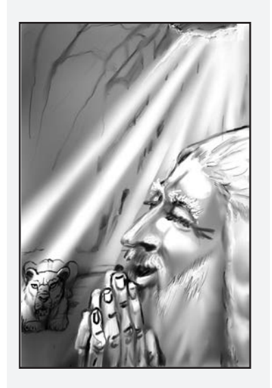
The stories in Daniel show us that God's people can stay loyal to Him when times are hard.

What are some of the things that make it hard for you to share your faith? How do you solve these problems?