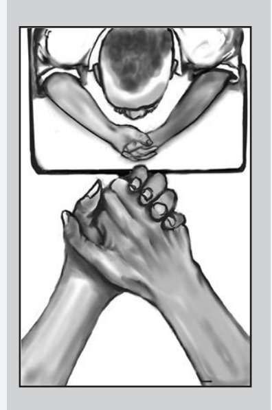
His teacher prayed to God before he taught every lesson.