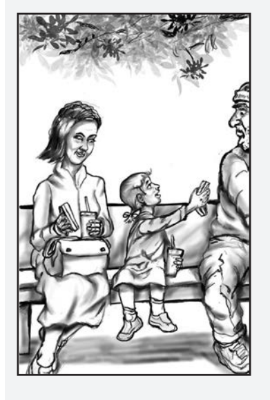
God can work in many ways in our lives. He can work in nature and in the things that happen every day.

Task #2: Make a daily record of special little things or big things God does for you. Read your record and pray that God will help you remember these things at the right time so you can share them with someone.