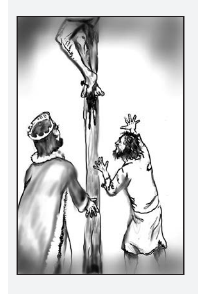
Jesus died for princes and also homeless people.

4 What other reasons may explain why the rich young man rejected Jesus while Zacchaeus accepted Him?