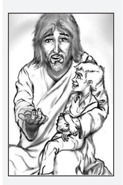
Jesus wanted to save the lawyer.

How can we use every chance that comes our way to share the Good News about Jesus?