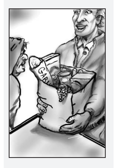
If our faith means anything, we must try to help the ones in need.

Task #2: Make a list of three people you know who aren't Seventh-day Adventists. What are their needs? How can you help meet their needs? What can you do for them in the coming week? Ask God to help you meet their needs.