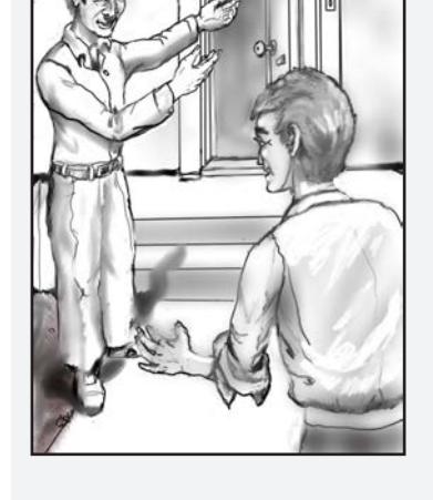
"Invite strangers into your house and make them feel welcome.