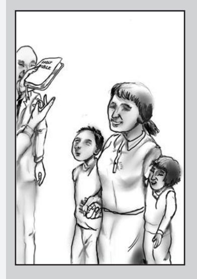
One of the men said, "The 7th day is the Sabbath."