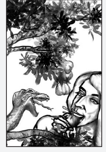
Satan tricked Eve into thinking that nothing bad would happen when she ate the forbidden fruit.

God continues to ask us today, "Where are you?" What does this question mean to you? How have you answered God?