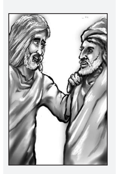
Jesus told His followers, Go to every country and group of people on earth. Go to every faraway country.

The church's work belongs to God. So, God will help us do His work. What should you do when you feel afraid or not good enough to do the work?