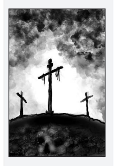
Jesus made peace for us with God when He died for us on the cross.

Jesus promised to be "with you always." How has Jesus kept His promise to you as you do God's work?