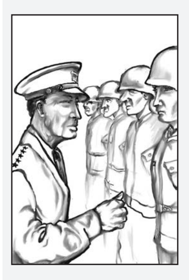
Paul talks to the church the same as a general talks to his army.

So far, Paul has used many word pictures to talk about the church. Paul compared the church to Jesus' body (Ephesians 1:22, 23; Ephesians 4:1–16), a building/temple that belongs to God (Ephesians 2:19–22), and Jesus' bride (Ephesians 5:21–33). What is the last word picture that Paul uses in Ephesians? Paul uses the word picture of the church as the army of God. We are nearing the evil day (Ephesians 6:13) when God's people will fight the final war in the battle against evil. We are all soldiers in Jesus' army. So, we need to be loyal to God and to each other.