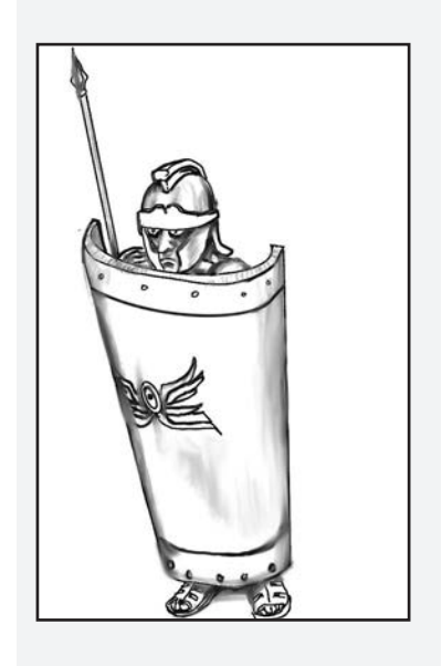
God is the same as a shield because He protects His people (Genesis 15:1; Psalm 3:3).

The last piece of God's battle suit is a powerful weapon. This weapon is the "sword of [from] the Holy Spirit. The sword is God's word [Bible]" (Ephesians 6:17, NIrV). A Roman soldier's sword was short with two sharp edges. In the same way, the Bible is a sharp weapon that "cuts" through Satan's lies. The Bible, with all its promises, is the most important weapon in our fight against evil.