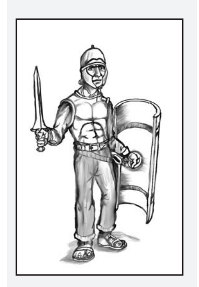
God's battle suit includes many parts: belt, chest piece, shoes, shield, helmet, and sword (Ephesians 6:14–17).

Paul warns us that we fight against evil angels. What is our only hope to win this fight?