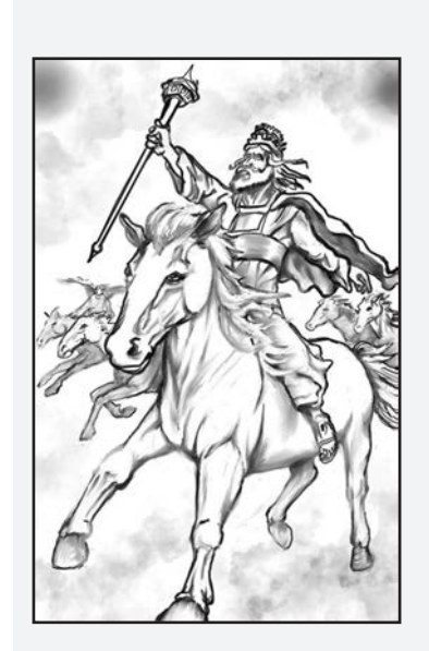
Ephesians 6:10–20 and the book of Revelation show the final fight when Jesus will win the war against Satan and his army.

ADDITIONAL THOUGHT: "In our work for God, we must be strong if we want to succeed. As loyal soldiers for Jesus, we must share the Good News in places that are under Satan's control. 'Our fight is not with people. It is against the leaders and the powers and the spirits of darkness [evil] in this world. It is against the demon world [Satan and his angels] that works in the heavens' [Ephesians 6:12, NLV]. What if we stop fighting? What if we decide to relax? What if we let Satan make us his prisoners? Will we be free from the fight and all the suffering that comes with it? Yes, we will. But the peace we will get from this decision will come at a terrible price. We will lose Jesus and heaven. We can't accept peace that comes from losing Jesus. It is better for us to fight to the end of earth's history than for us to get peace that comes from leaving God and choosing sin."-Ellen G. White, Advent Review and Sabbath Herald, May 8, 1888, adapted.