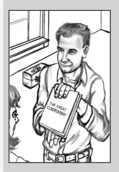
"My job was only to offer the book to her."