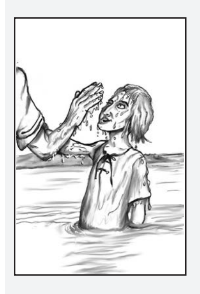
"Ta tekna" can mean children who are young or old. The children that Paul talks about are young enough to be trained by their parents (Ephesians 6:4). At the same time, these children are old enough to make the decision to follow Jesus.

Paul finishes his advice to children by asking them to remember the fifth commandment. The Ten Commandments are very important to Paul (read Ephesians 4:1–6:9; also, read Ephesians 4:25, 28; and Ephesians 5:3–14). Paul starts his quote with, "You must respect your father and mother" (Ephesians 6:2, ERV). Then Paul adds, "This is the first command that has a promise with it" (Ephesians 6:2, ERV). Paul finishes his quote with, "If you respect your father and mother, you will live a long time and your life will be full of many good things" (Ephesians 6:3, NLV). No parents are perfect. But the fifth commandment shows us that God's plan for our lives includes honoring our parents.