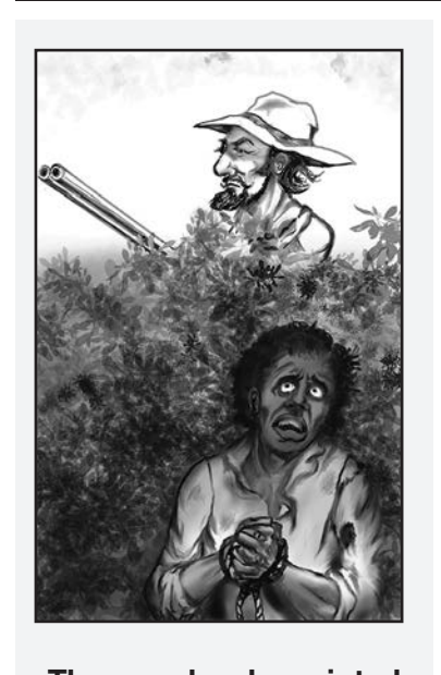
The people who printed the Bible removed any verses that they thought would cause slaves to run away or fight against their masters.

READ FOR THIS WEEK'S LESSON: Ephesians 6:1–9; Matthew 18:1–5, 10; Colossians 3:21; 1 Timothy 6:1, 2; 1 Peter 2:18–25.