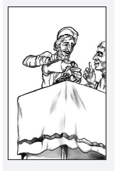
Paul also tells slaves to "work gladly as if you were working for the Lord and not for men" (Ephesians 6:7, WE).

What does Paul ask Christian slaves to do? Read Ephesians 6:5–8 for the answer.