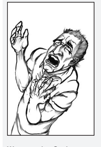
We must let God remove our angry feelings and angry words.