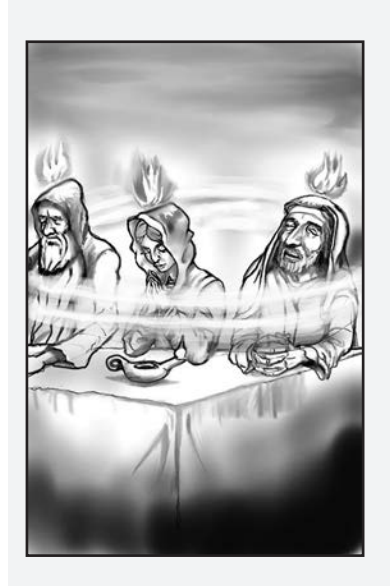
The gifts Jesus gave His church are gifts from the Holy Spirit.

What comfort do you get from Ephesians 4:7–10? How do these verses show you what Jesus did for us?