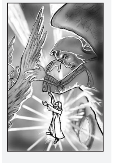
Jesus won the war against Satan and his evil angels (read Colossians 2:15).