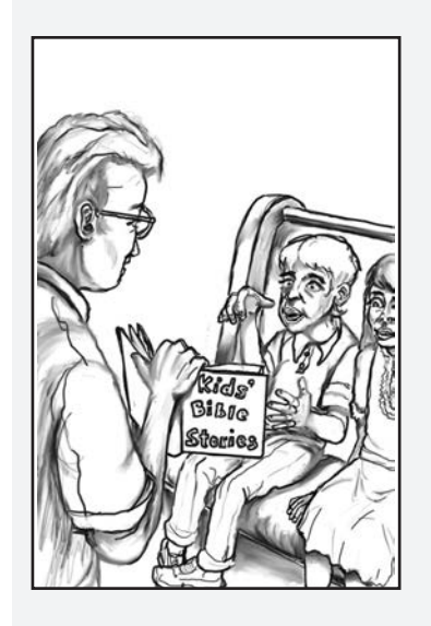
If we want peace and agreement in the church, we must do our part.

Read again Ephesians 4:4–6. How do these verses make you feel? How should they make you feel when you remember that God accepts us because of Jesus?