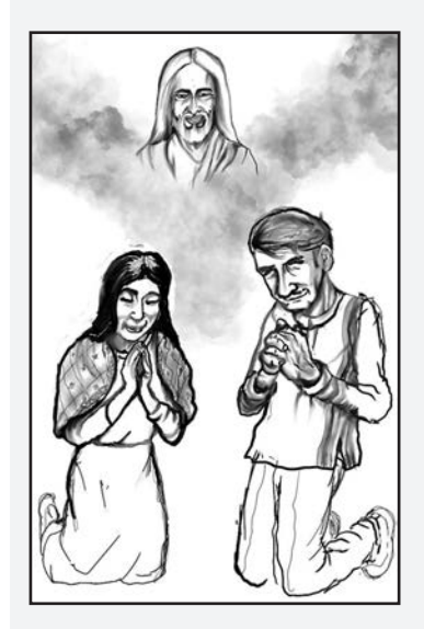
Jesus wants us to trust that He can solve any problem we have.

What was your past experience before Jesus saved you? Why is it important to remember this experience often? If Jesus hadn't saved you, how would you be living your life now?