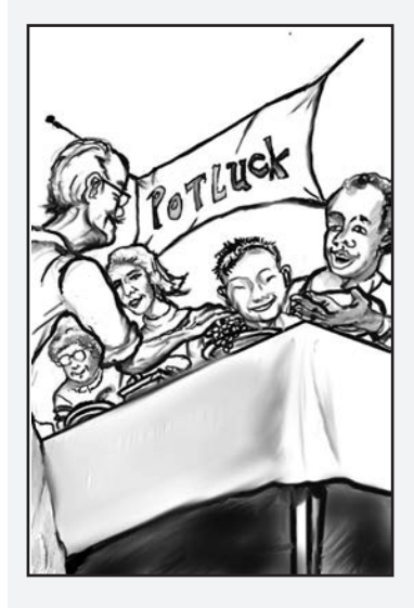
When church members are at peace with each other, we show God's plan for peace and agreement under Jesus' control.

What race problems do you see in your community? How may the church help to solve these problems? What can you do to help?