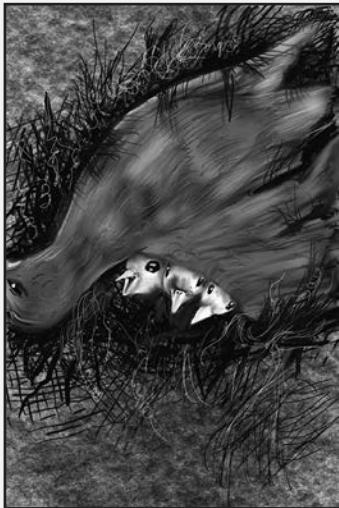
The ranger saw three baby birds under the mother's wings.

MEMORY VERSE: “There is another reason for doing what is right. You know what time it is. It is time for you to wake up from your sleep. The time when we will be taken up to be with Christ is not as far off as when we first put our trust in Him. Night is almost gone. Day is almost here” (Romans 13:11, 12, NLV).