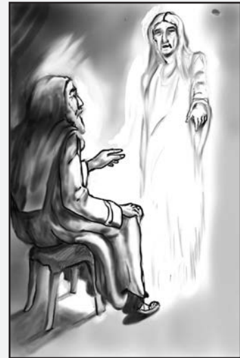
In Daniel 9, the angel Gabriel comes to explain to Daniel about the 2,300 days

In Daniel 9:24–27, we read about Jesus’ death. His death is connected with God’s work as Judge, in Daniel 8:14. What important Bible truth does the connection between these verses teach us?