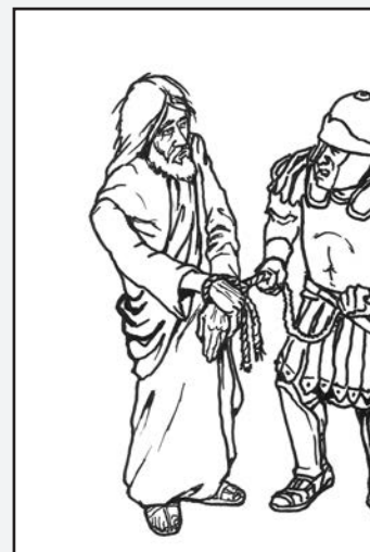
John saw many things happen in the life of Jesus.

In a way, John is telling his own story about Jesus. What is your own story about your friendship with Jesus? How can you help someone feel more joy in the Lord, as John tried to do?