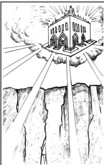
God's work as Judge in heaven leads to His everlasting kingdom at the end of human history.