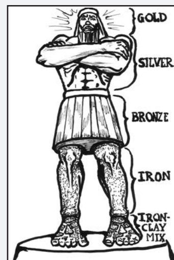
Nebuchadnezzar’s kingdom is shown as the head of gold (Daniel 2:38).

Read John 14:29. What does Jesus say that helps us to understand the reason that God gives us prophecy?