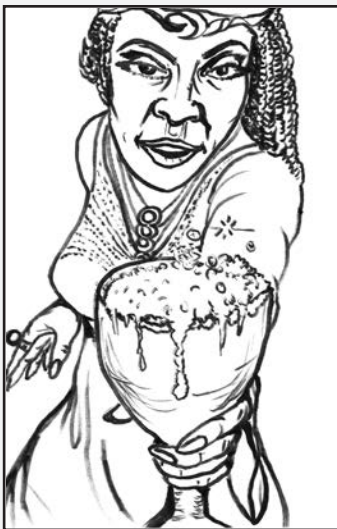
The wine is a word picture for Babylon's false teachings and false worship.

Belshazzar's wild party shows us what will happen in the end times. In Revelation 17, we see end-time Babylon as a woman. She behaves the same as Belshazzar. She holds a gold cup filled with wine. She offers it to the people on the earth. The wine is a word picture for her false teachings and false worship. The wine causes people to sin (Revelation 17:4–6). The woman behaves as if she does not care that God will judge her soon. And He will judge her.