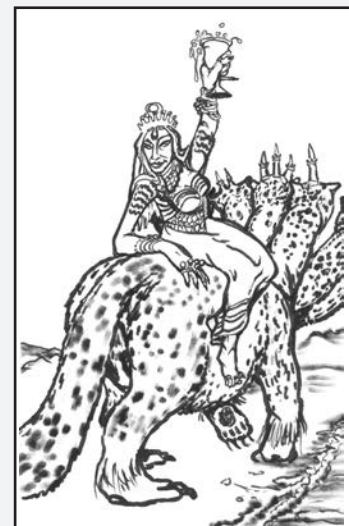
In his vision, John sees an evil woman who sits on a red wild animal.

Babylon’s clothes also help us remember the clothes worn by Israel’s top holy leader in the Old Testament. This leader is the high priest. His clothes also have the same colors that the prostitute wears: purple, red, and gold (Exodus 28:5, 6). The colors of these clothes tell us that the woman is a word picture for the end-time religious power that Satan uses to turn the people on the earth away from God. She is “drunk” from drinking the blood of God’s people who died for their faith. That connects end-time Babylon to the Roman Catholic Church in the Middle Ages. That church killed millions of Christians because they believed the Good News about Jesus.