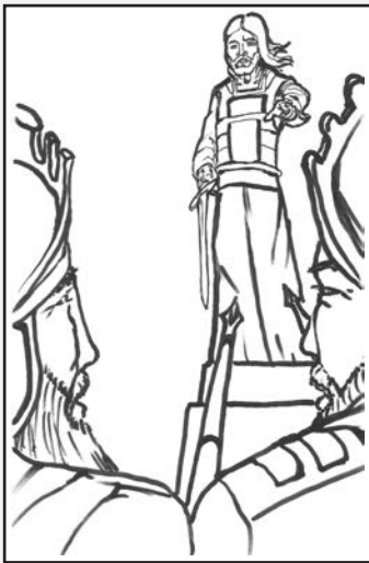
The dragon and his team cause the ten kings on the earth to make war with the Lamb, who is Jesus.

The Last Troubles cause the ten kings to stop supporting Babylon. The ten horns, or kings, fill with hate for Babylon. John says they tear off her clothes. Then they eat her flesh and burn her with fire. These word pictures use Old Testament words to explain God's work as Judge against the city of Jerusalem (Jeremiah 4:30). In the Old Testament, if the daughter of the most holy leader in Israel is found guilty of selling sex to men for pay, she will be burned in a fire as punishment (Leviticus 21:9). Revelation 16:10–12 show us that the worldwide powers who support Babylon learn that Babylon tricked them. These kings believed that Babylon was able to protect them from God's anger. When they learn that she cannot protect them from the Seven Last Troubles, the kings attack her. In the end, God judges Babylon and her supporters. They experience God's full anger against them for their evil behavior.