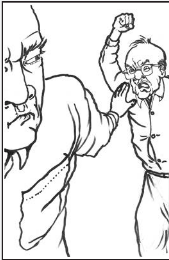
Our scolding sinners does not often bring them to Jesus.

As part of that work, Timothy should invite, teach, and encourage believers. The Bible itself guides us in the same way (2 Timothy 3:16). Timothy must follow Bible truth and teach it to other people. He must be patient and show love to people when he does this work. Our scolding sinners does not often bring them to Jesus. With the Holy Spirit’s help, Timothy’s work will join the church as one in Jesus.