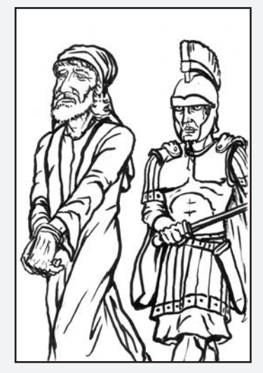
The army leader takes Paul to the Roman war building in Jerusalem.

False stories help start this wild fight. Why must we take care not to believe false stories or tell them to other people?