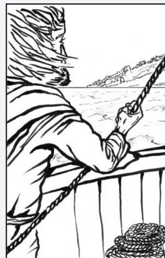
God told Paul in a night vision to sail across the Aegean Sea to Macedonia.

Think about why Paul circumcised Timothy. What should this decision teach us about why we sometimes need to do things we might not think are important but that will help us do more work for God?