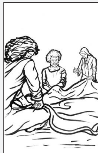
Paul and his friends Aquila and Priscilla shared the same faith. All three of them were also tentmakers.

Paul felt hopeless about his chance to share the Good News with the Jews in Corinth. Paul needed the Lord to support him. How do the Lord’s words to Paul, in Acts 18:10, give us hope, too, when we need it most?