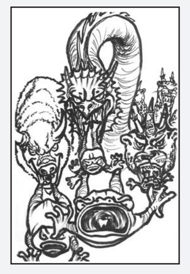
Revelation 16:12–16 uses the word picture of frogs coming from the mouth of the dragon, the false messenger, and the wild animal power that comes from the sea. These frogs are a word picture for evil spirits or demons.