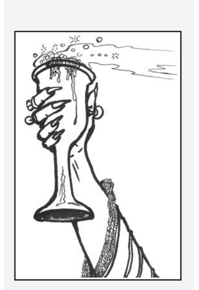
The wording " 'the strong wine of her terrible [awful] sins' " points to Babylon's false teachings, evil actions, and the bad things that come from them.