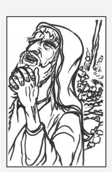
Elijah prayed a short prayer. God burned up everything fast, including the altar and the soil under it. It was now clear to everyone who the true God was.