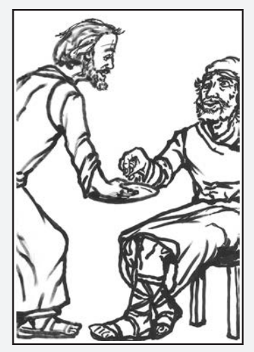
Jesus' followers collected money at home for God's people on the first day of the week. But their reasons for getting together had nothing to do with a change in the Sabbath.

Not one verse we looked at shows that the believers met together to worship on the first day of the week. Their reasons for getting together had nothing to do with a change in the Sabbath. Christians who say these verses prove that the Sabbath was changed to Sunday are making these verses say something they never meant to say.