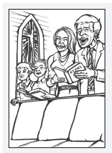
When we honor the Sabbath, we show other people that we are loyal to God.

This week we will study about God's law. We will look at the Sabbath and the religious power that tried to change the Sabbath law. We also will study what this "change" to the law means for us in these last days of earth's history.