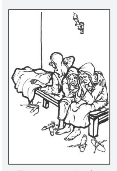
The women who followed Jesus rested on the Sabbath day after He died. Their resting on the Sabbath shows us that Jesus never changed it.

How can you share the truth about the Sabbath in a gentle and loving way with people who worship on Sunday?