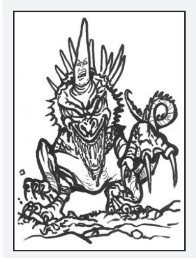
The little-horn power in Daniel 7:23–25 is a word picture for the Roman Catholic Church.

Revelation 14:7 uses words taken from the fourth commandment (Exodus 20:11). How does Revelation 14:6, 7 help to show us that the Sabbath will have a very important part in the last war over worship? This war will happen on this earth before Jesus comes back.