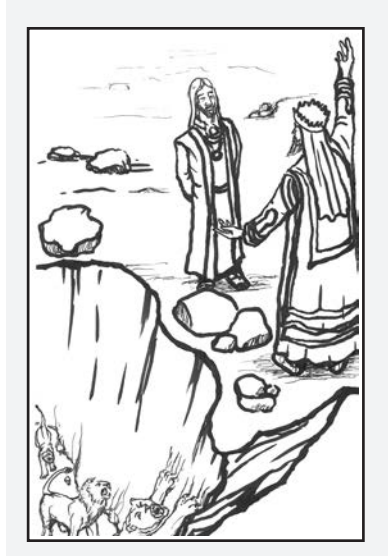
King Darius's words show that he knew Daniel's God was powerful.

Read Daniel 6:4, 5 again. What connection is there between what happens in these verses and what happens in Revelation 13:4, 8, 11–17 in the last days?