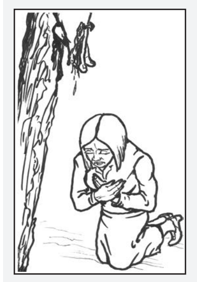
Jesus' death on the cross for us should help us not to be proud.

What does the Cross teach us about why we should not be proud? Where would we be with no Cross? Why is the Cross the only thing we can brag about? (Read Galatians 6:14.)