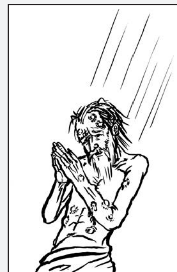
Job was loyal to God even after bad things happened to him. He is an example of a loyal servant of God.

Are you loyal to God? If yes, how loyal are you? How can you show your loyalty more?