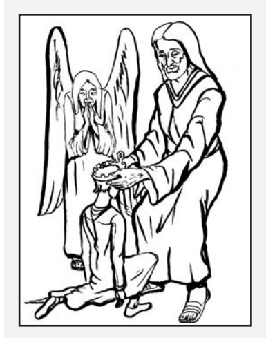
God's righteousness is the only power good enough to give us His promise of everlasting life.

Are there times when you wonder if you are saved? Or if you ever can be? Where do these fears come from? Could they be coming from living your life in a way that goes against your beliefs? If yes, what choices must you make to help you know that you are saved in Jesus?