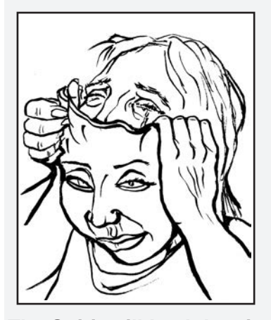
The Spirit will lead the sinner to tear off the mask he or she wears. This mask is the false face of lies and human works.

When was the last time you took a long look at your reasons for the things you do? It can be hard to examine ourselves this carefully. What is your only hope?