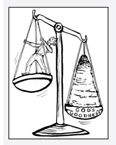
No one is as good as God is.

How often do you find fault with other people for doing the same things you are guilty of doing? How can following Paul's words help you to change?