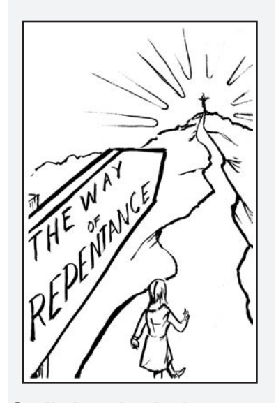
God's love leads, but never forces sinners to turn away from sin.

How often do you feel the need to repent? Or do you try not to think about your sins, and pretend your sins are not real? What will happen if you continue to pretend your sins are not real? What danger will you be in? What can you do to change? Why must you change?