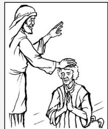
Paul made it clear from the start that God called him to be an apostle.

In what ways is the Bible being questioned today within our church? What form do these attacks against the Bible take? How have they affected your own thinking about the power of the Bible to change your life?