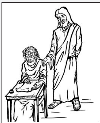
Paul argues that he received his gospel from God alone.

Why does Paul say that Gentile believers do not need to be circumcised? Paul's enemies say it is because Paul wanted to bring as many people into the church as possible. They accuse Paul of caring more about numbers in the church than about the truth. Paul knew that Gentiles might not want to be circumcised. So Paul's enemies may have thought that was the reason Paul did not require the Gentiles to be circumcised. As a result, Paul is accused of being a people pleaser! Paul answers by pointing his attackers to his strong words in Galatians 1:8, 9. These verses clearly show that Paul's purpose is not to get others to think well of him. Suppose Paul wanted that. Then he would have answered in a different way.