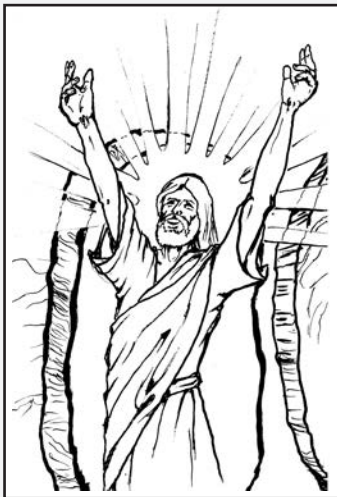
Christ's death and return to life broke the power of sin and death.

Write down your understanding of what the gospel is all about. Try to use no more words than Paul uses in Galatians 1:1–5. Bring your words to class on Sabbath.