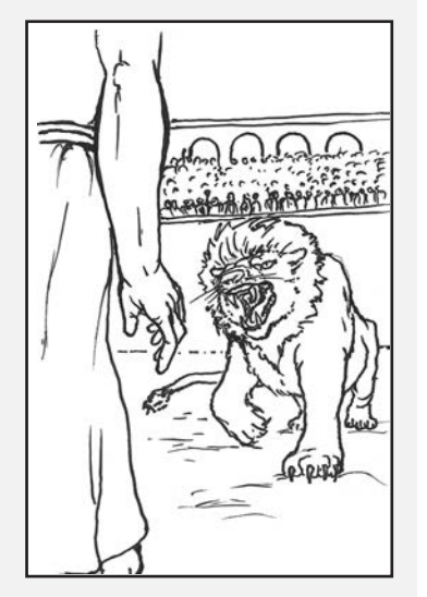
For the first few hundred years of church history, just being a Christian could result in a horrible death.