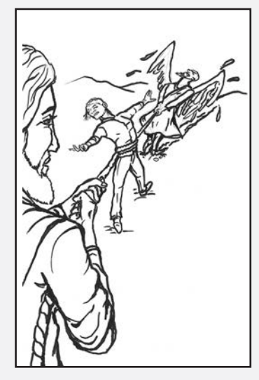
We suffer because we are in the middle of the great war between Christ and Satan.

Why is knowing personally God's goodness and His love for you such an important part of being a Christian? Why is knowing God in this way very helpful to the person who is suffering? How can we all learn to know God better and to know how real His love is?