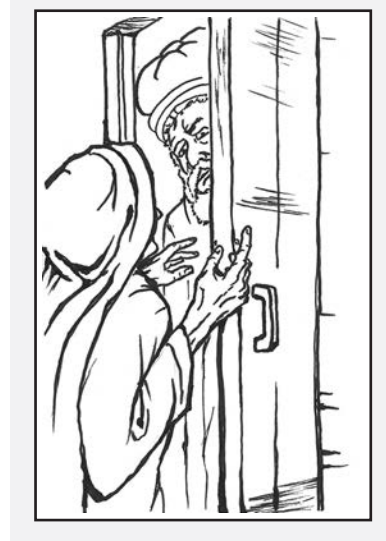
The widow knows she will win her case if only she can find a judge who will take her case.

Think of all the evil in the world that has gone unpunished. And all the evil that is still unpunished. So why is the idea of justice and of God's holy judgment so important for us as Christians? What hope do you get from the promise that justice will be done?