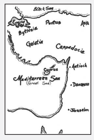
Peter identifies the places where his letter is sent: Pontus, Galatia, Cappadocia, Asia, and Bithynia.