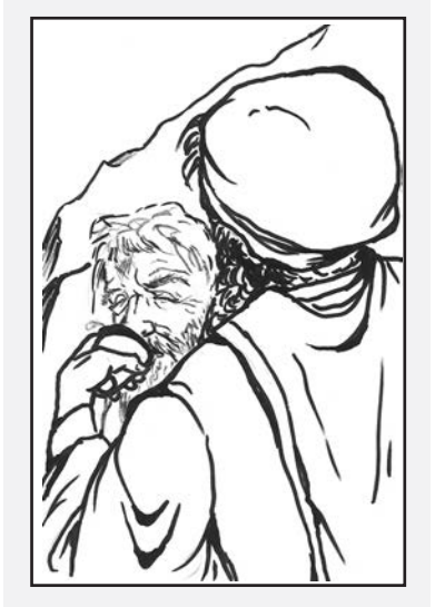
Love for others comes from a heart that has been "born again."The new birth comes through living out the truths of the Bible.