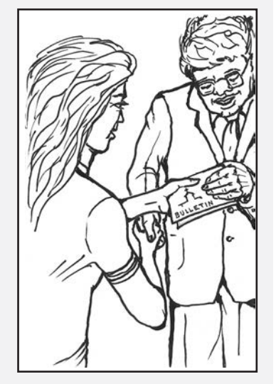
Churches should show they are filled with the kind of love that comes from a "pure heart."

• How can our faith grow, even when we suffer? That is, what choices can we make to help us to learn from our suffering?