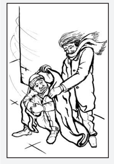
We make the Holy Spirit happy when we use what we have made with our own hands to do good for the poor.

It is important to know the truth of the three angels' messages in Revelation 14:6–12. But ask yourself this question, How do you treat others, especially those who are under you or those who can do nothing for you? That is, how do you treat those who have nothing to offer you in return?