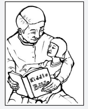
God treats us as a loving father treats his learning child.