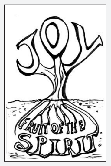
Joy is rooted in the fruit of the Spirit.

Joy, peace, and patience—how much of this fruit do you experience in your life? Which one of these do you need more of in your life?