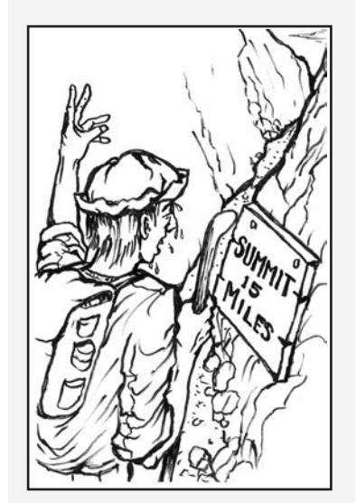
We need God's Spirit to fill us every day. Why? Each day brings new tests and hardships.