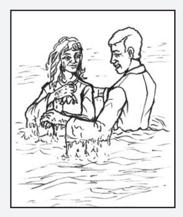
Paul says that we are all baptized by the Spirit into one body (church) of believers.

What has been your own experience in being baptized (filled) by the Holy Spirit? What has He meant to your life? What would you be like without Him working in you?