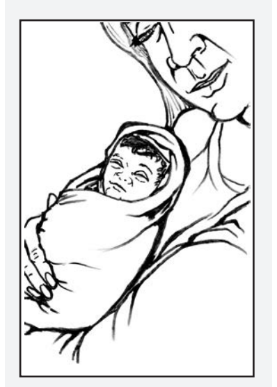
The Spirit can do miracles. He caused a virgin to give birth to Jesus.