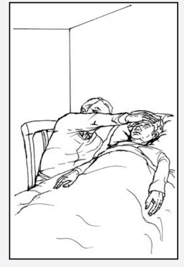
Healing the sick is a very important part of our work for God.

"Faith without works is dead." How true have you found the idea to be that faith and works are closely connected? How do works make your faith grow?