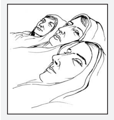
All ten virgins needed to be awakened out of sleep.

How can we guard against being lazy and uncaring about the Second Coming? As time goes by, how can we remember that the Lord's return is soon to come?