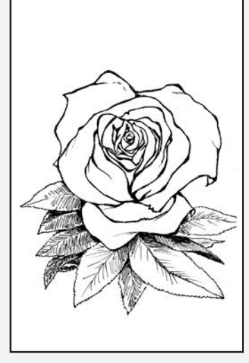
All things living will declare that God is love.

Read Revelation 22:21. In what way does this verse capture the important message of all that we believe?