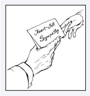
Loving action is the clear result of true sympathy.

While eating breakfast, a man listened to his wife read in the news about a tragedy<sup>6</sup> in another country that left thousands dead. After talking for a few moments about how terrible it was, he then changed the subject and asked if the local soccer team had won the match the night before. In what ways are we all somewhat guilty of the same thing? What can we do about it, if anything?