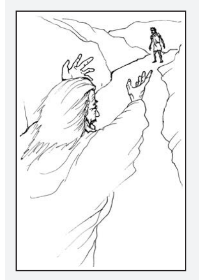
The Father's heart of merciful love leads Him to empty all that He has in order to restore His prodigal son.