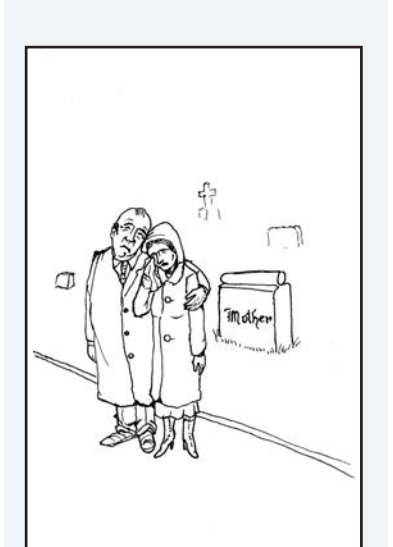
God's heart of love is touched by our sorrows and even by our talking about them.