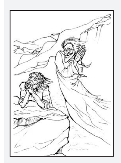
Starved and thin, Jesus was alone in the wilderness, an easy target, it seemed, for Satan's attacks.

Satan glorified (praised and honored) himself. But Jesus sacrificed (gave up) Himself, even to the point of death. What can we learn from this powerful difference? How can we make use of this important truth for ourselves? How should it influence the way we make certain decisions, especially when our ego (sense of self) is perhaps too big?