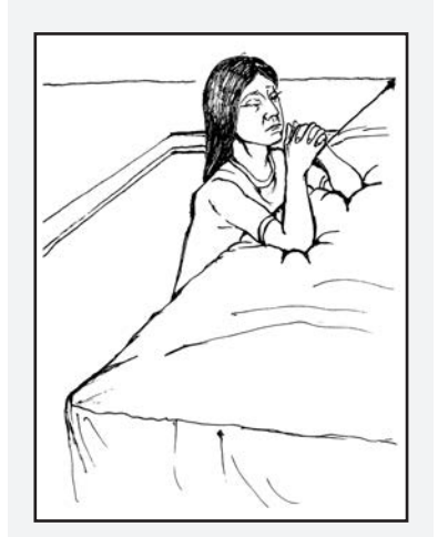
We need to pray for those who pressure us and let God make us more sensitive to their problems.

What kind of peer pressure do you have? How can you stay strong? In what ways are the words "overcome evil with good" (Romans 12:21) helpful in such situations?