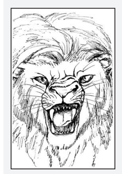
The devil is like a hungry roaring lion looking for its next meal.

How do we, as the years go by, hold on to the promise of the Second Coming? Why is it very important that we do?