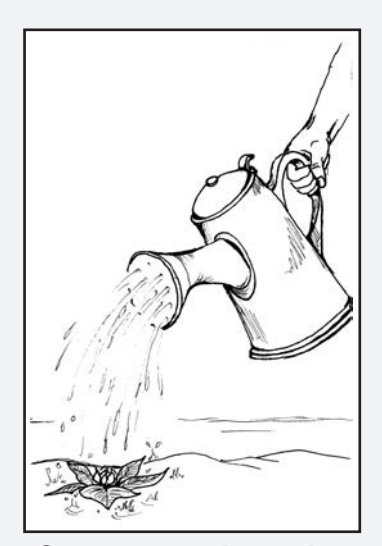
One person plants the seed of the gospel, another waters it, but God makes it grow.

PAUL AND THE REBELLION (WAR AGAINST GOD)