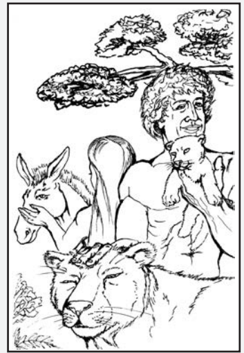
The Creator invited our first parents to be co-rulers with Him and to care for all living things.

In what ways does the Creation story in the Bible give special honors to humans that evolution<sup>2</sup> cannot? From the Bible view of human beginnings, ask yourself: Am I treating everyone as they deserve to be treated?