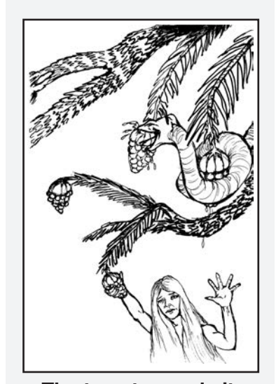
The tempter made it appear to Eve that God was not only dishonest but also withholding something good from humans.

Satan mixed truth with error. What are some things people believe that are a mixture of truth and error? Why is that always a deadly mix?