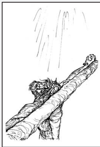
The Cross is proof of God’s love for us and desire to save us.

What powerful warning is found in Genesis 6:11–13; Romans 1:18; 2 Thessalonians 2:12; Revelation 21:8; and Revelation 22:15?