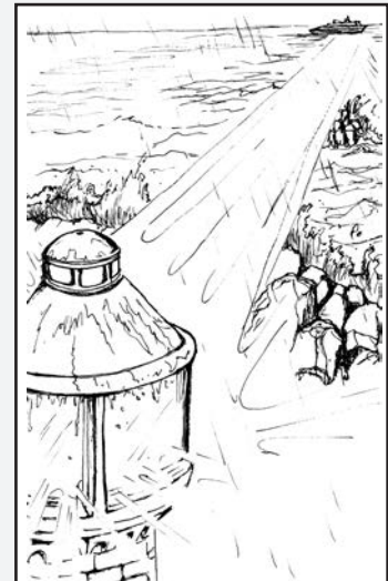
We are to be God’s light to the world.

Of course, no one ever said that it was going to be easy. We are in the middle of a great controversy (war between Christ and Satan). And the enemy will work every way he can to stop our outreach work in our own neighborhoods or in the farthest corners of the world. But we must not be discouraged, because we have been given many wonderful promises of power. And we can be sure that God will fulfill His purposes on earth. As we have been told: “The words I speak are like that. They will not return to me without producing [making] results. They will accomplish [succeed] what I want them to. They will do exactly what I sent them to do” (Isaiah 55:11, NlrV).