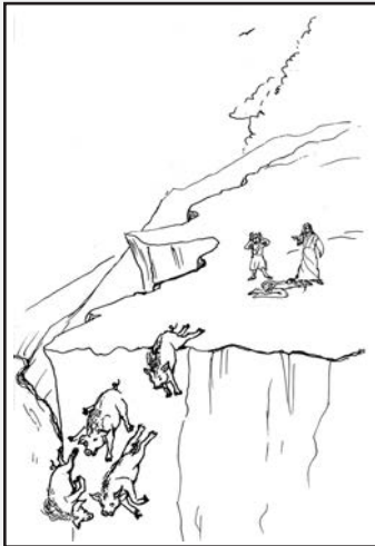
When the pigs drowned, the people asked Jesus to leave.