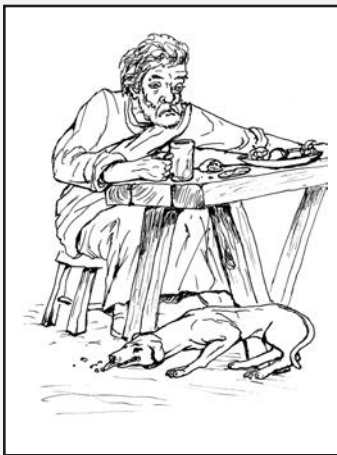
Jesus compared the Syrophenician woman's people to dogs to test her faith.