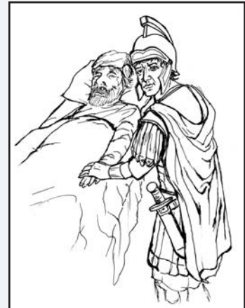
The faith of the centurion was rewarded: his servant was healed.

We may learn different lessons from the stories of this healing. But we can know that big cultural divides could not keep the Jews and this Roman apart. What lessons can we take from this about how we must go beyond cultural differences in good conscience in order to reach out to others?