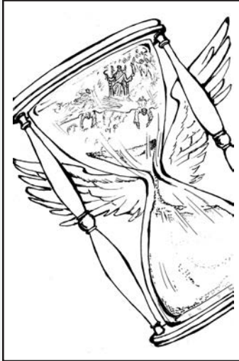
Daniel points often to the end times in his writings.

Daniel did not just give the meanings of other men's dreams. In Daniel 7–12, Daniel had his own visions that revealed the future of great world superpowers. Daniel's visions proved that, no matter what earthly rulers plan to do, God holds the final control of the nations. In the end, He and His final kingdom will succeed, and that victory will be complete (read Daniel 2:44).