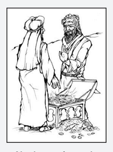
Abraham refuses the spoils of war. His unselfishness is a witness to the king of Sodom.

Think about your dealings with others. What kind of witness do they present to others about your faith?