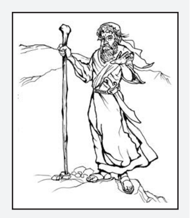
Like Abraham, we must leave our pasts behind when they are not in harmony with God's law and will.

In what ways have you experienced what it means to step out in faith? What hardships have you faced? What joys have you experienced? Knowing what you know now, what might you have done differently?