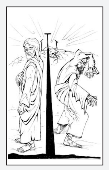
The cross draws a clear line between Christ and Satan.