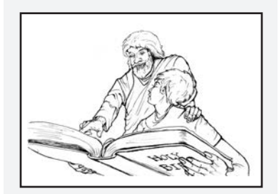
To Jesus, the true test of "family" is not blood relationships but doing the will of God.