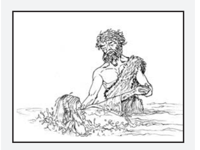
Baptism, or burial by water, is an outer symbol of an inner change.

Read Romans 6:1–6. What spiritual lessons is the apostle (teacher and leader) Paul giving in connection with the act of baptism? Note the comparison he makes between the act of water "burial" and rising out of the water with dying to sin and living for righteousness (goodness and truth). How real has this new life in Christ been to you?