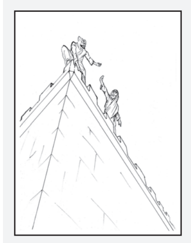
Jesus defeats Satan's temptations through the power of the Bible.

Note four important biblical teachings on temptation: (1) no one is free from temptations; (2) when God lets temptations come to us, He also gives grace<sup>4</sup> and strength to overcome; (3) temptations do not come the same way every time; and (4) no one is tempted beyond his or her strength to withstand them (1 Corinthians 10:13).